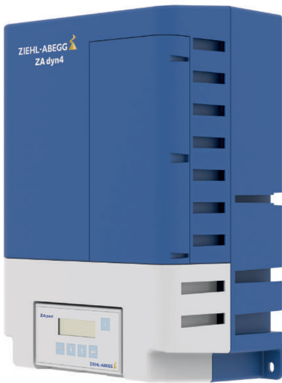
ZAdyn4C frequency inverter

Units in the ZAdyn series are frequency inverters developed exclusively for elevator technology. The varied housing designs and universally compact construction make them ideal for control cabinet installation and for wall mounting.