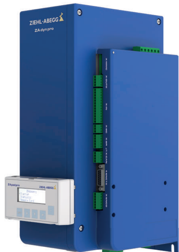
ZAdynpro frequency inverter